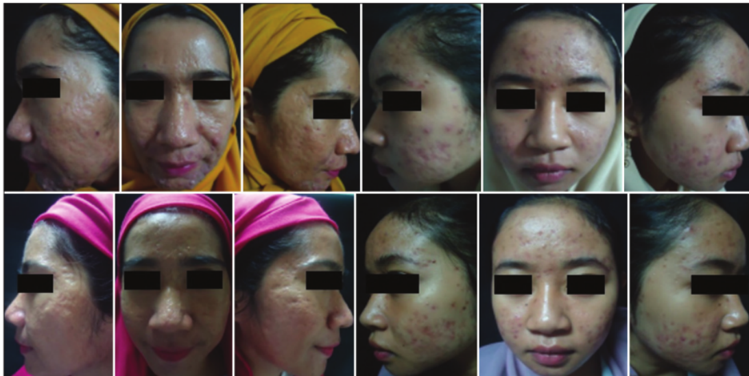
Figure 2: Clinical improvement after 28 days of the autologous serum and doxycycline group

In this study, menstrual estradiol levels (follicular phase) were obtained in levels ranging from 20.8 to 200.5 pg/mL. The concentration of estradiol levels is lowest during the menstrual phase with serum concentrations around 40–200 pg/mL. Meanwhile, the level of estradiol during preovulation was around 250–500 pg/mL, so it was concluded that the estrogen levels in the menstrual phase were lower than that of the preovulatory phase. Low estrogen levels are associated with the severity of acne. Androgen hormones increas 16 the production of sebum, so that the sebum levels in patients with 14 acne vulgaris are higher than in normal people [10]. There is a relationship between sebum excretion a 16 the severity of acne vulgaris because the sebum levels in patients with severe acne vulgaris are found to be higher in levels. Estradiol can inhibit sebum production to reduce sebum levels. The use of